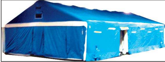
DAT® 37' X 50' - 30 BED SHELTER

Pneumatic technology is now a preferred system for Hospitals/Medical Centers according to specifying influences: