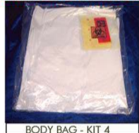
BODY BAG - KIT 4

F-PCH-KIT4 - FSI Body Bag Kit - a complete cadaver kit which includes, 1 body bag (8mil, 36" X 94", straight zipper, #5 pulls, heat sealed seams, guaranteed 300# static lift capacity), 3 - ID Tags, 3 - contamination tags, 1 - biohazard tag. 10 bags/case