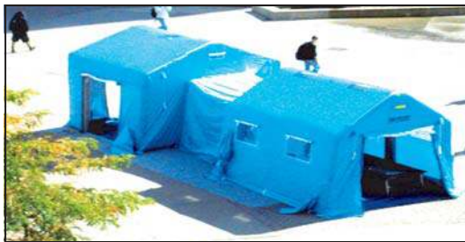
Many configurations available