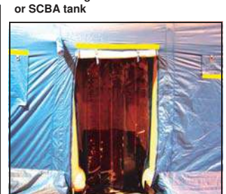
Bump through Strip Screens

FSI NORTH AMERICA® SAFETY THROUGH TECHNOLOGY A Division of Fire Safety International www.fsinorth.com