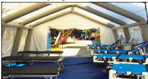
Spacious Interior—most will accommodate beds positioned end to end