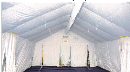
HVAC Plenum and Inner Liner