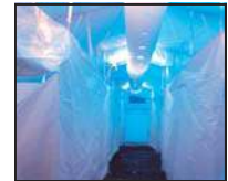
Center Aisle and Air Plenum