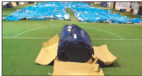
Limited Storage Required