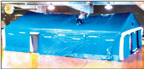
Excellent Roof Load Capacity

In recognition of the extreme requirements of the surge capacity markets that may require shelter systems to be in place in all manner of severe weather for extended durations of weeks and even months FSI is pleased to offer a most robust, durable range of shelters to meet this demand.