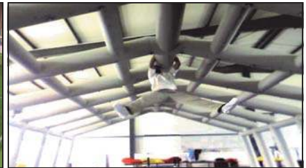
5 Center Air Berm Extreme Load Bearing